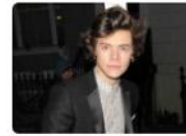
Inquiring Minds Want To Know, Is Harry Styles Dating A Stripper Or Ke$ha?