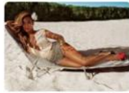
I'll Say It, Beyonce Is Overrated