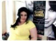
Rebel Wilson Plays J.Law's Sister In An Amazing Spoof That Never Aired At The MTV Movie Awards