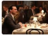
Mad Men Sympathy Rankings: The Return Of Dick Whitman