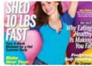
Isla Fisher Doesn't Own A Scale Because She Has Daughters, Also Morals