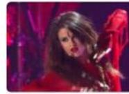
Selena Gomez Used Last Night's Awards To Remind Us That She Shouldn't Sing Live